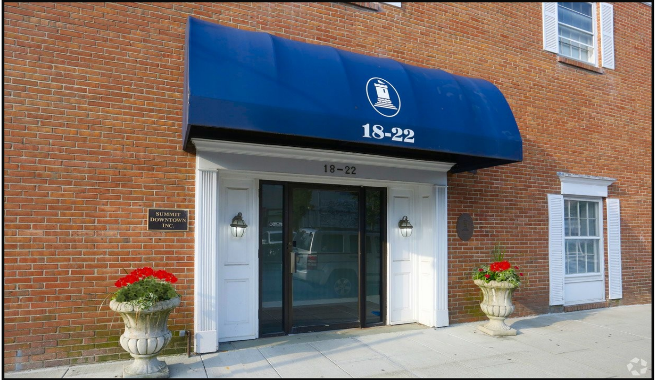
The entrance to Bank Street Centre at 18-22 Bank Street, Summit, New Jersey 07901

Furnished Offices Includes High-Speed FIOS Internet Conference Room Reception Area Free Use of Copier and FAX 24 Hour Tenant Access